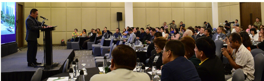
Mayor Jonas Cortes discussing the City’s Land Use Plan (CLUP).