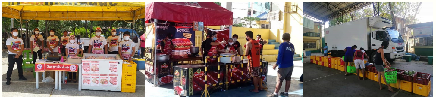
The Mandaue Bayanihan Caravan was implemented following the standard protocols to ensure safety and harmony among consumers and sellers.