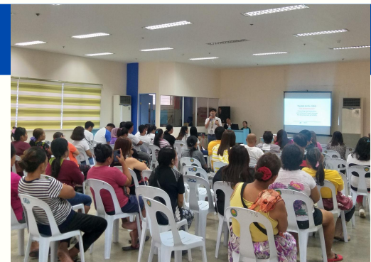
A number of vendors from the Mandaue City Public Market attended the orientation done by DTI.

The DTI-Satellite Registration ran from March 2 to 3, 2020. A total of 62 new DTI registrants for the two days on site registration in Mandaue City Market.