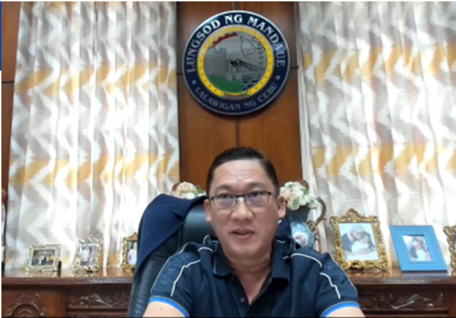
Mayor Jonas C. Cortes addressing the business sector via Zoom.