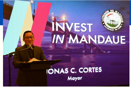
Mayor Jonas C. Cortes addressing the participants of the Investment Forum.