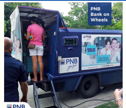
A woman was transacting through the PNB - Bank on Wheels.

It was able to cater to the four barangays in Mandaue City namely Barangay Tingub, Casuntingan, Cubacub, and Tawason.