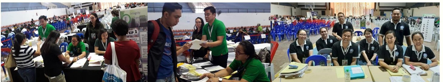
MIPAC personnel assisting several business processors during the Business One-Stop-Shop.

BANTAY MANDAUE: MANDAUE CITY'S COVID-19 MONITORING WEBSITE